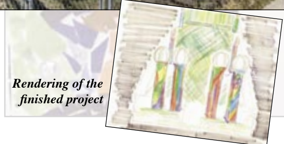
Rendering of the finished project